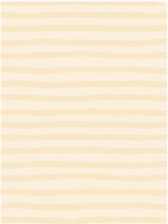
Custard Cream Stripe